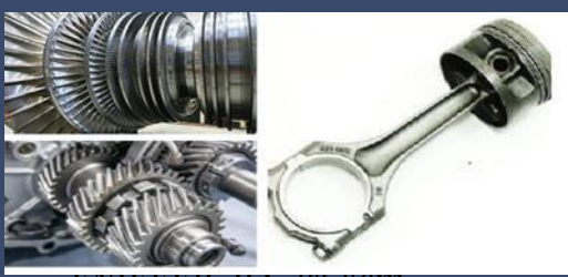
ENIFFER .P.S 7 th SEM