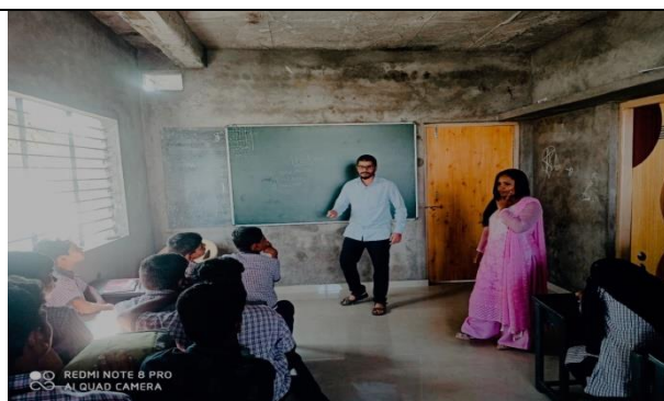
Activity on how to prepare for Exams