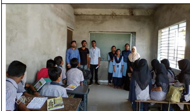
Activity on Information and Technology