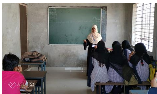
Activity on Information and Technology