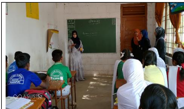
Activity on latest Computer Technologies