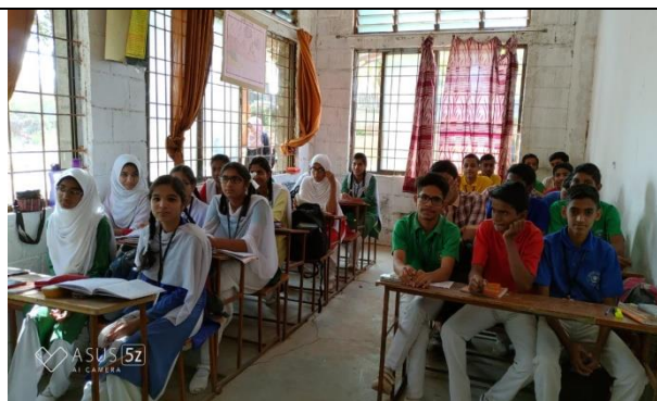
Activity on latest Computer Technologies