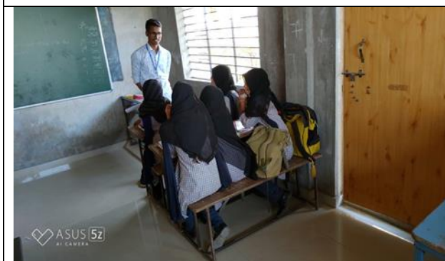
Activity on how to prepare for Exams